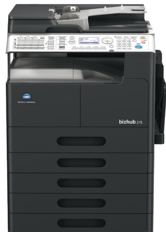
Optional configuration with four paper drawers.