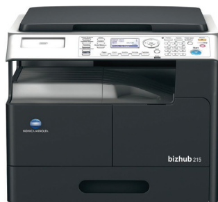
Base product without options.

The bizhub 215 expands your productivity with sleek design for desktop placement or for modular expandability that lets you add a mid-size cabinet, 100-sheet bypass tray and up to four optional 250-sheet drawers for floor-standing setups.