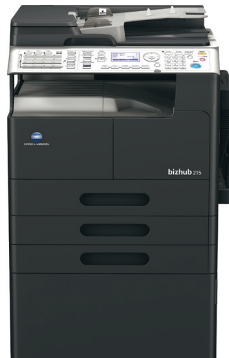
Optional configuration with DK-707 Copy Desk.